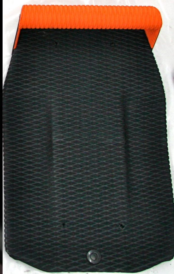
FOODWELLS - PLATE