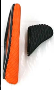
FOODWELLS - LEFT