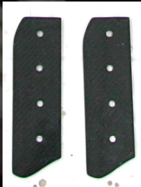
FOODWELLS distanceplate left