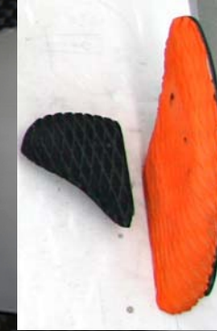
FOODWELLS - RIGHT